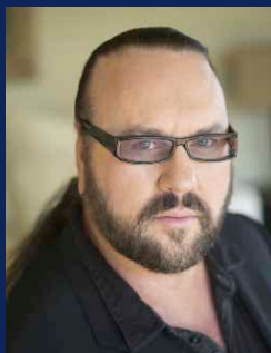
Desmond Child Chairman Emeritus

Latin Songwriters Hall Of Fame was founded by Desmond Child & Rudy Pérez under the auspices of the Songwriters Hall Of Fame in New York. Desmond and Rudy were inspired to create the LSHOF for the same reasons the Recording Academy created LARAS: to create an organization exclusively devoted to recognizing and spotlighting the artistic achievements of Latin music makers.