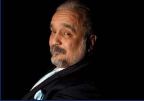
Willie Colón (Puerto Rico)