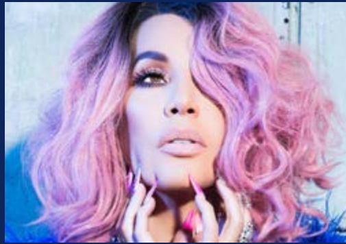
Ivy Queen (Puerto Rico)