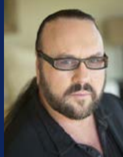
Desmond Child Chairman Emeritus

Latin Songwriters Hall Of Fame was founded by Desmond Child & Rudy Pérez under the auspices of the Songwriters Hall Of Fame in New York. Desmond and Rudy were inspired to create the LSHOF for the same reasons the Recording Academy created LARAS: to create an organization exclusively devoted to recognizing and spotlighting the artistic achievements of Latin music makers.