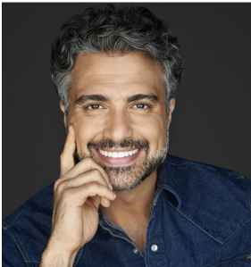
Host: Jaime Camil